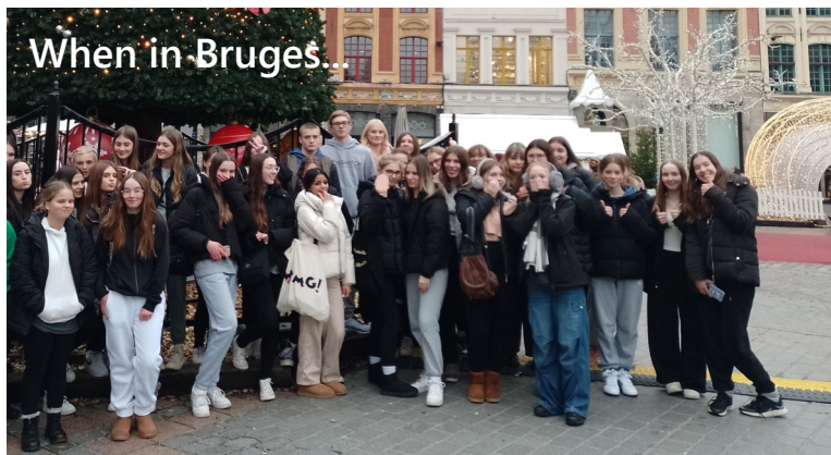
When in Bruges...

Languages students visited three countries in three days when they took a whistle stop tour of some of Europe's famous Christmas markets.