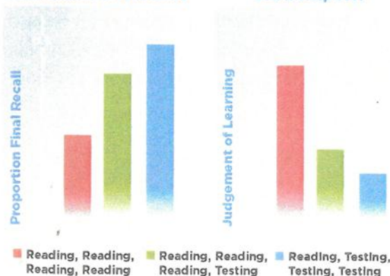
"Did it Help Me?"